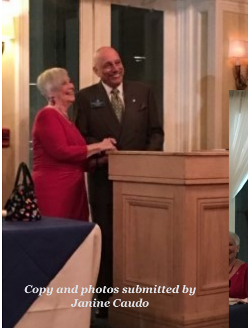
Copy and photos submitted by Janine Caudo